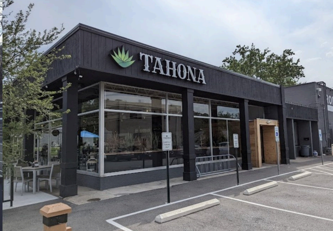
115 S KARL BROWN WY, LOVELAND, OH 45140